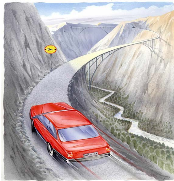
Fig. 2: Horizontal vs. vertical

Maybe the road administration would know why certain regulations are necessary, but road users would not understand. Therefore, efforts needs to be made to design road environment in a reasonable way, because infrastructure influences the behaviour of road users constantly: the mentioned wide and straight roads encourage higher speeds, suggest (psychologically) priority at crossings, draw the focal attention to the front and therefore worsen peripheral vision in the immediate vicinity.